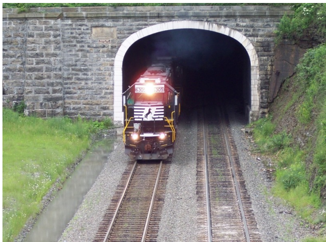
NS 6305 blasting out of the Gallitzin Tunnel after climbing the grade at Horseshoe Curve.