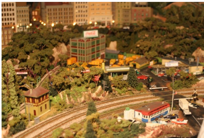
Scene on B&M New Hampshire Division.

Early on Friday, we went to The Allegheny Portage Railroad Park, Gallitzin Tunnels Park, then to Horseshoe Curve Park, and then to Altoona. In Altoona we went to the RR Museum, two model railroad hobby shops, and a hotdog shop. After hotdogs, we headed off to Scranton and checked into the hotel. We spent Saturday at Steamtown National Park. We started off the day taking many photos of the static displays and the tourist steam trains. We then went on a train ride to Moscow, PA, about 26 miles each way. Great ride! We had just enough time after the ride to go on a tour of the shops.