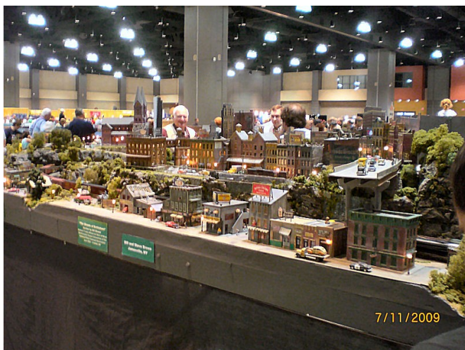
National Train Show.

learned how to make front row buildings from inexpensive plastic kits, how to scratch build with styrene, and with wood. We found out how to build CTC panels from free JMRI PanelPro software, how mail was delivered by rail, how to animate for operation, tips and tricks for scratch building. We learned how to kitbash buildings and how to make our own castings in resin. We attended clinics on judging the model contest, had a first hand discussion on the “Judging Code of Conduct”, and how to fill out those pesky contest/AP forms. We had an introduction to SoundTrax, and how to get big sound from little trains, and advanced tsunami programming. We attended the Digitrax Users Forum and heard from AJ and Zana Ireland. We attended clinics on modular structures, plaster casting rocks & walls, design and construction of steel mills, home brew scenery, modeling the prototype, speakers, building craftsman structures, planning a more realistic operating session, modeling tips, painting and weathering. One of my favorites was titled “Numbers? You don’t Need No Car Numbers!”. It was a novel car forwarding scheme that doesn’t need or use car numbers.