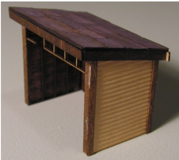
Fig 1: Milk platform shelter