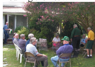
Pleasant day by the lake