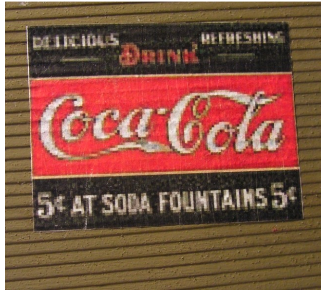
Fig 2: Paper sign on siding.

Another clinic led us through mounting paper signs on walls. Sheets of paper advertising signs were provided, along with small pieces of wood siding, sandpaper, and white glue (there was no fee for this one). The clinician led us through sanding both sides of the sign to give it a weathered look on the printed side and thin so it would look more to scale. We then glued it onto the siding. Here's the result from that clinic (Fig 2).