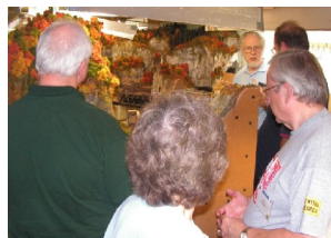
Touring the P&W