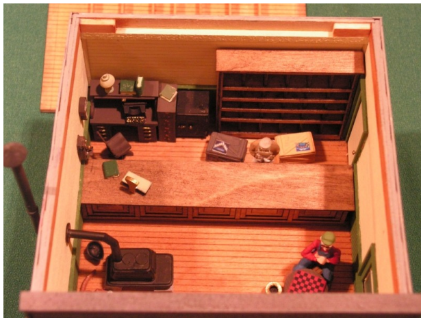
Fig 6 Sample of contest models.

There was also merchandise available in the MER store, a White Elephant sale, door prizes/raffle, and the Auction which was held after the banquet. Some good items were available at reasonable prices. I picked up a few car kits to fill out my roster. Athearn kits for $2.00 looked reasonable to me. Locomotives were available for $20-$25, even for some Athearn Genesis models in excellent condition. There were several boxes of