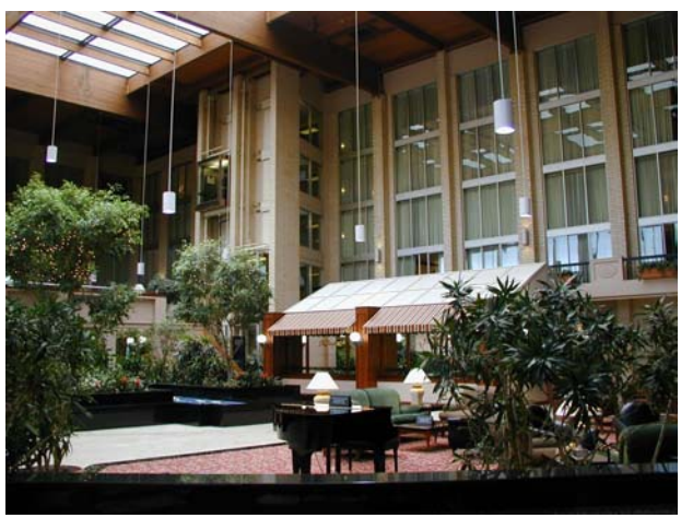
Nice accommodations at Convention Hotel

The convention included a good array of clinics with some "notable" presenters including Dean Freytag and Paul Dolkos.