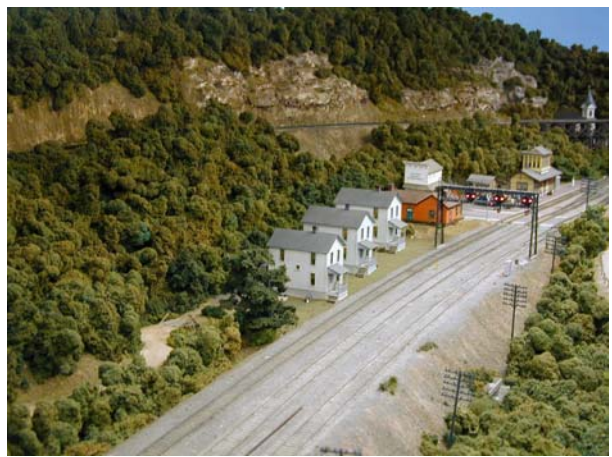
Don Cassler's M&K Division of B&)

Model and Photo contests were nicely populated. (Your editor was happy to present three traction models that won some nice awards in the model contests.)