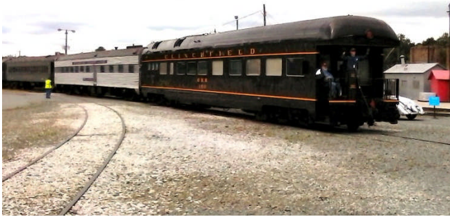
The caboose train is always popular with the kids.