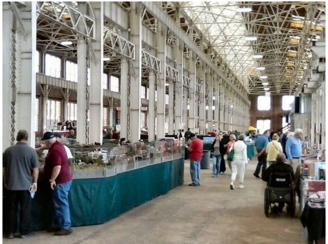
The Train show was housed in the newly refurbished Back Shop. Some layouts were also displayed there as well as the auxiliary buildings

Division Website: www.carolinasouthern.org