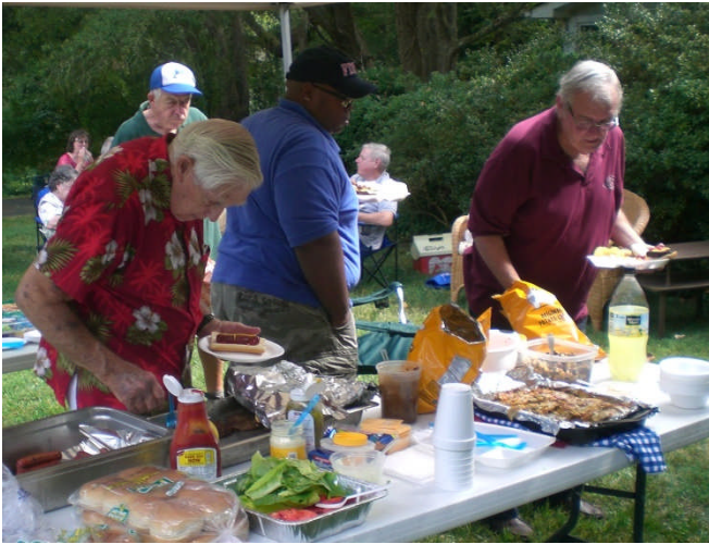
Time to Dig In