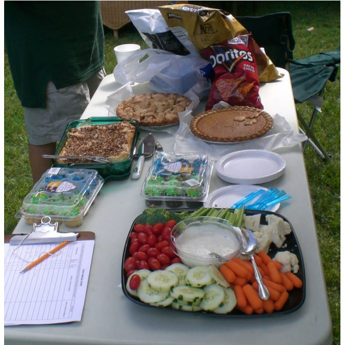
And then there was desert...

Here's a rogues gallery of a few of the past and present Carolina Southern Division principals who attended the picnic this year.