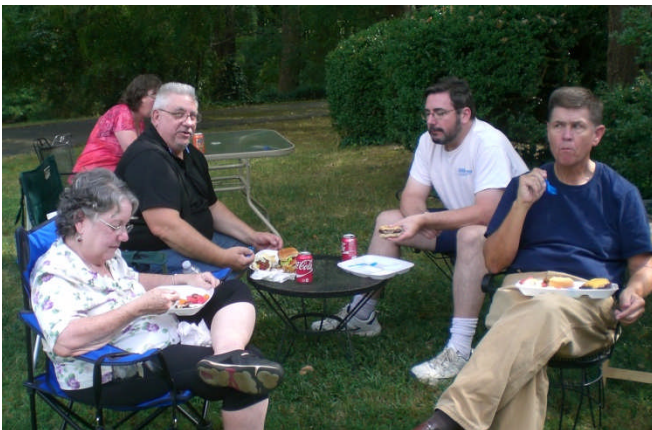
Enjoying the food and (railroad?) conversations at a great location