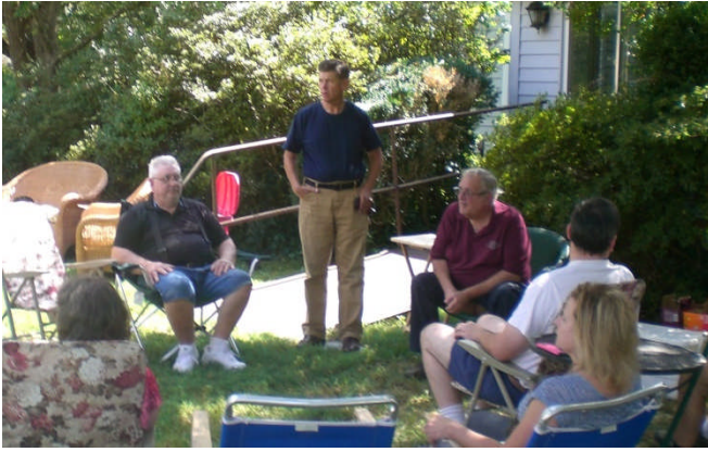
Waiting for the food...