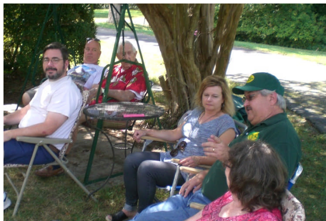
Railroad Conversation before the Eats