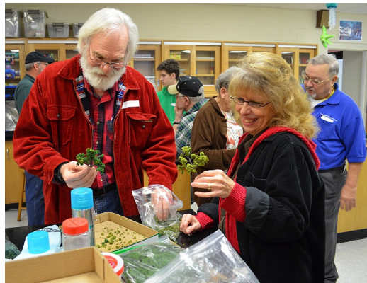
After the intro, the Scenery class gets to work. Tables were set up with various activities and attendees rotated between them.