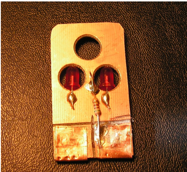
Completed (working) tester assembled by your Editor.

Most tested good by the end with just a couple of minor glitches, disappointing the members who came to watch hoping for some amusement as someone fumbled the project.