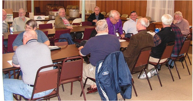
Members discuss their ideas on track cleaning

that is available at woodworking shops. It is abrasive, but soft so it won't scratch as much as the typical BrightBoy type track cleaner.