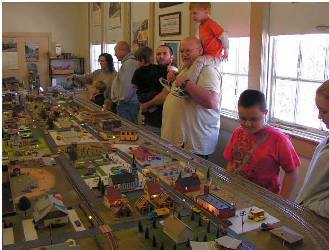
The Train Town layout puts on a good show for visitors.

November 12, Train Town in Brookford held an open house and train show. Members of the Division set up several displays and demonstrations to show people visiting the layout various aspects of model railroading. There were tables set up for scenery, weighting cars, sound, scratchbuilding, and track laying and wiring. The Division had its display board set up to acquaint people with the NMRA and had one of its Timesaver layouts set up next to the display to let people try their hand at switching.