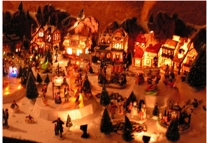
The town square is crowded with carolers and strollers celebrating the holidays.

Areas between the tracks are filled with model houses and businesses all decked out for the holidays. Many figures form small scenes everywhere you look. Everything is lighted in bright holiday colors.