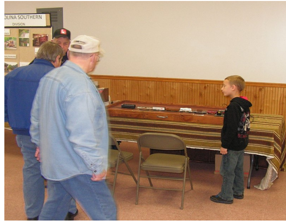
A customer sizes up the Timesaver challenge