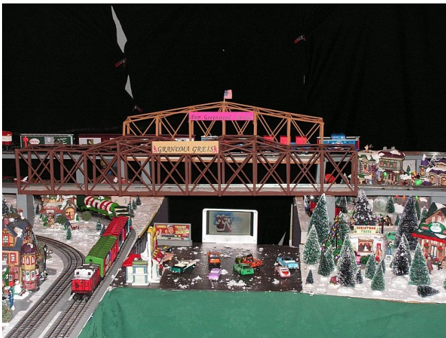
The Drive-in is showing White Christmas