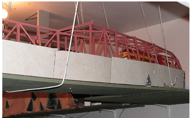
Part of the bridge carrying trains overhead.

John Montalbano has built several long bridges from scratch. Two are on the main level and another carries two tracks overhead. Also on the overhead level is a trolley line shuttling back and forth.