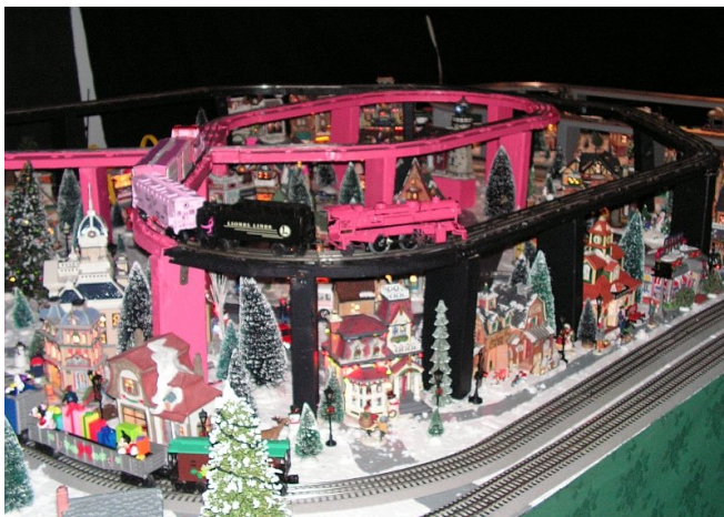
A load of presents is delivered by gondola while the Pink Engine circle overhead.

Straight ahead as you enter the garage is a model drive-in movie theater which is showing (really) White Christmas on a small LCD screen.