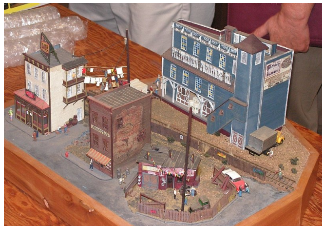
Detailed city scene showing how Frank's methods can produce high quality results.

Frank brought along many models to illustrate his techniques including a highly detailed diorama of a back street scene in a city.