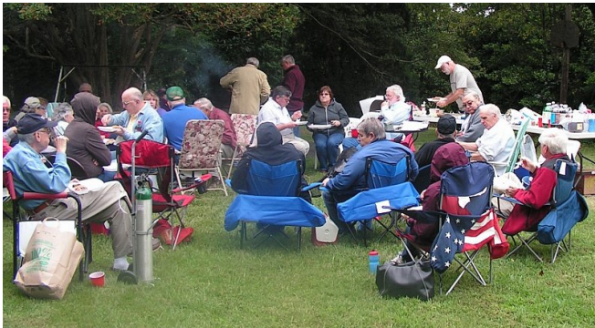
Food and company was plentiful as Division members and guests chow down at the Picnic