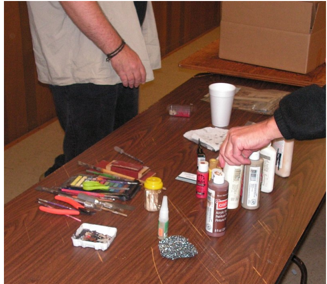
Basic tools, glues, and paints provide the materials to produce realistic models.

adding one drop at a time to an eyedropper or pipette of water and testing each on a scrap of wood keeping track of how many drops were used for each scrap. After the scraps dry, he chooses the one that is the closest match to what he wants.