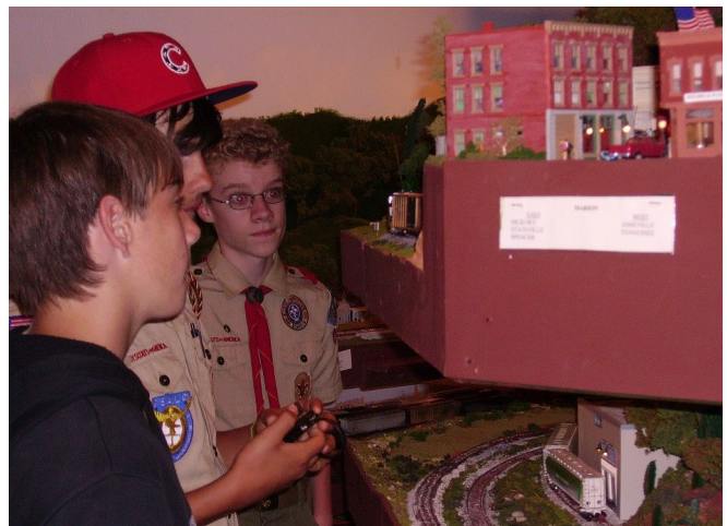
Are they hooked?

It's a great experience – introducing young people to the hobby we so love, and maybe starting a spark of interest. Over the years, I've had several Scouts bring their families back to see the layout and to participate in OpSessions.